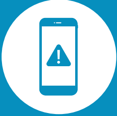
FIND & ALERT