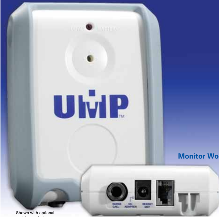
Shown with optional cushion protector