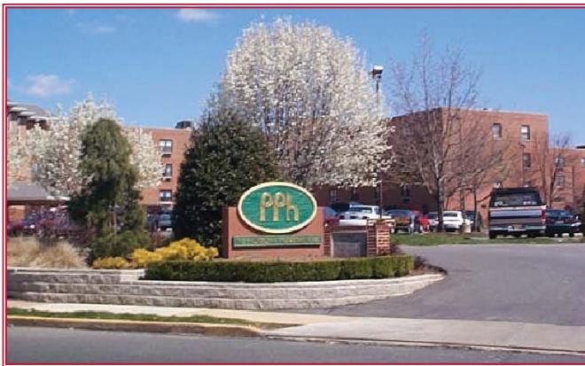
Philadelphia Protestant Home, Philadelphia PA