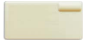
The Asset Tag

Using the same basic infrastructure, you can also locate and protect other high-value equipment or important assets, everything from notebook PCs to the keys to the medicine cabinet.