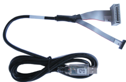
Customized EX3300 Serial Cable for GoJo TFX and LTX Dispensers