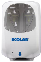
EcoLab NEXT GEN Touch-Free Dispenser