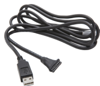
Customized EX3300 Serial Cable for EcoLab Dispensers