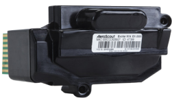
EX3300 Exciter for GoJo TFX Dispensers

The Hand Hygiene Compliance Monitoring Solution provides a revolutionary way for healthcare facilities to monitor staff compliance with the hand hygiene policy.