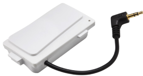
EX3300 Exciter for GoJo LTX Dispensers