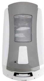
GOJO LTX Touch Free Dispensers

Includes the following TFX dispenser brands: PURELL TFX Touch Free Dispenser PURELL Surgical Scrub TFX Touch Free Dispenser PROVON TFX Touch Free Dispenser