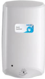
EcoLab NEXA Touch-Free Dispensers