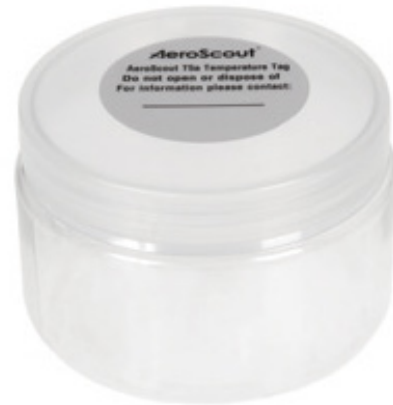
T5a Tag Temperature Stabilizing Container (SKU: TAC-500)