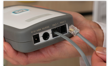
Connect two pads to a single monitor at the same time—no need to continually disconnect and reconnect pad cords.