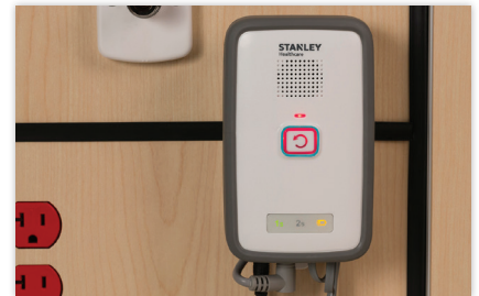
Audible and visual feedback confirms desired alarm settings and when an individual is actively being monitored.