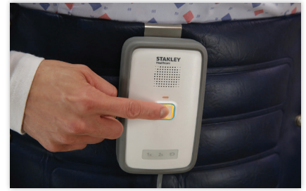
A wide array of mounting options allow the M200 to be affixed to a headboard, wall, wheelchair, side chair, or by a toilet.

For more than 30 years, STANLEY Healthcare has partnered with thousands of healthcare facilities. Across the U.S. and around the world, our innovative fall management solutions are helping improve patient and resident outcomes while enhancing caregiver efficiency. The M200 represents our most advanced fall management solution. It’s a compelling opportunity for your facility to take its program to another level in terms of quality, safety and efficiency. It’s also a way to support cost-saving goals—empowering you to reduce the incidence of falls (“never events”), purchase fewer monitors and drive operational efficiencies through greater standardization across your organization.